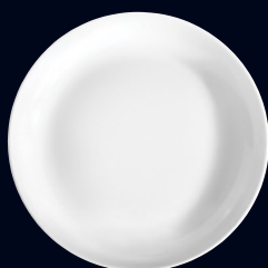
Coupe Plate 6625V321 D 12 1/4" 6625V319 D 10 1/2" 6625V317 D 7 3/4" 6625V316 D 6 1/4"