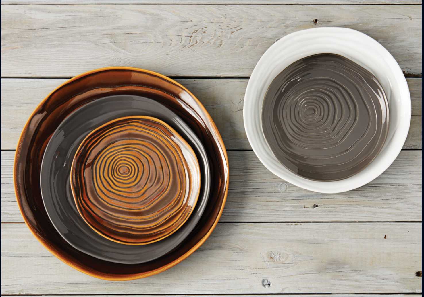
Assorted Grain Coupe Plates

With colors developed to meet the specific needs of the US market, Grain capitalizes on the farm-to-table movement by bringing a sense of nature and movement to your presentation. The coupe plates capture the essence of wood grain, rippling water and stone, while the brilliant colors pair well with Pillivuyt's bright white porcelain body. The addition of embossed coupe bowls and mugs creates a complete collection that is sure to make any table come alive.