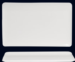
Rectangular Plate 6632V549 L 13 1/2" W 6 1/4" 6632V555 L 11 W 7" 6632V552 L 8 1/2" W 6 1/4"