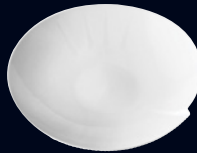
Deep Plate 6677V186 D 10" H 2 1/8" (40 oz)