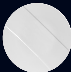
Plate Linear Well 6636V886 D 12 1/8"

Stylish and modern in design, the Grand Chef collection by Pillivuyt add a special flair to any signature presentation. Free-form indentations create an unexpected, eye-catching twist in this “must have” collection.