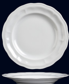
Plate 6640V923 D 11 1/2" 6640V922 D 9" 6640V921 D 6 3/4"

Introducing the Queen Ann collection. Pillivuyt's bright white porcelain body accented with a gently scalloped rim creates an elegant profile that is both classic and delightfully old-fashioned. With revitalized interest in eclectic tabletop décor, this vintage collection capitalizes on current trends by lending nostalgia and sophistication to any presentation.