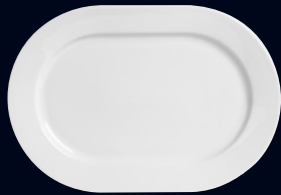
Oval Platter 6631V502 L 14 1/4" W 9 3/4"