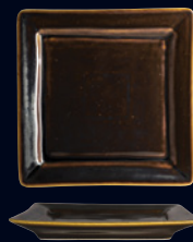
Square Plate 6661V437 L W 8 1/4"