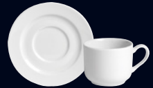
Chocolate Cup 6631V527 W 4 5/8" H 2 1/2" (10 oz) Saucer 6631V472 D 6 1/2"