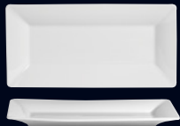
Rectangular Platter 6628V443 L 10 1/4" W 5 1/2"