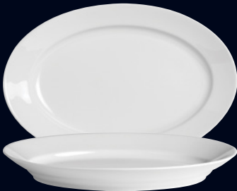
Oval Platter 6626V376 L 17 3/4" W 12 1/4" 6626V372 L 11 3/4" W 8" 6626V369 L 8 3/4" W 6" 6626V367 L 6 3/4" W 4 1/2"