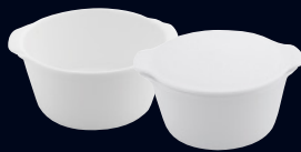
Deep Cocotte 6659V968 D 7 7/8" (2.3 qt) 6659V965 D 6" (30 oz) Lid 6659V970 D 7 7/8" (Fits V968) 6659V967 D 6" (Fits V965)