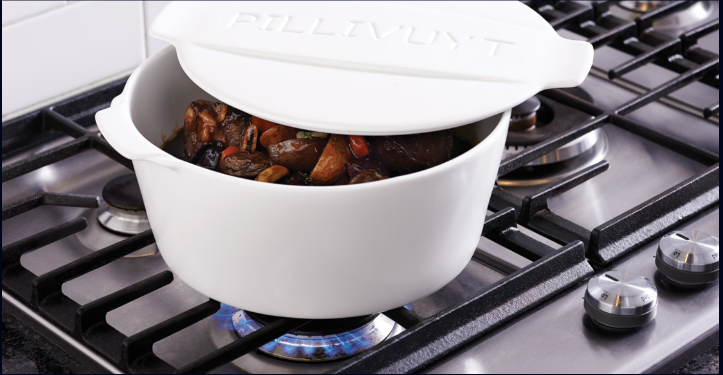
Large Cocotte 6659V971 D 9 7/8" (4 qt) Lid 6659V973 D 9 7/8"