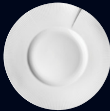
Large Rim Plate 6677V183 D 11 1/2" 6677V182 D 9 7/8"