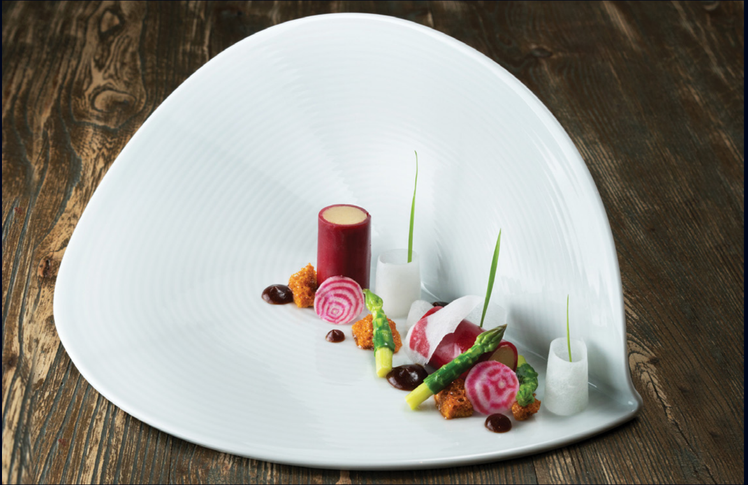
Folded Presentation Plate 6677V180 L 11 7/8" W 7 3/8" H 5 1/4" Keith Pears Executive Chef • Delta Toronto Toronto, ON