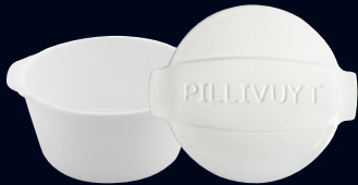
Large Cocotte 6659V971 D 9 7/8" (4 qt) Lid 6659V973 D 9 7/8"

The Ulysses Collection allows you to cook directly on all types of appliances including direct flame, oven, microwave, electric burners, ceramic, and induction cooktops. The hardness of the proprietary satin-matte glaze makes Ulysses virtually non-stick and very easy to clean. Extremely thermal shock resistant, the products can go from freezer to oven to tabletop. Multi-functional lids can be used during cooking then placed on the table as a trivet for serving.