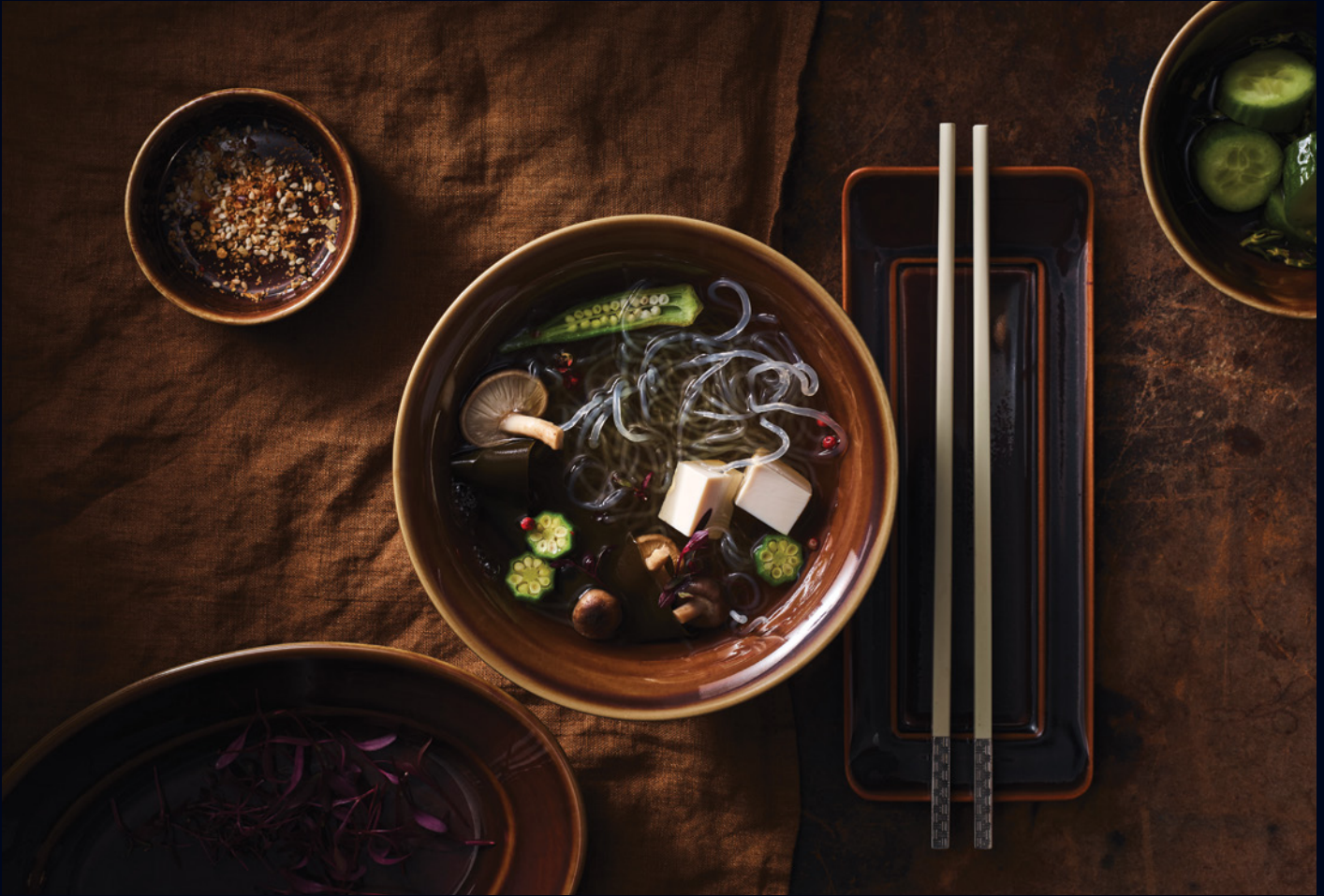
Assorted Sento Items 6661