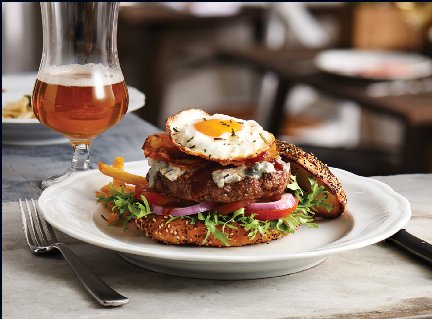
Plate 6640V922 D 9"

Introducing the Queen Ann collection. Pillivuyt's bright white porcelain body accented with a gently scalloped rim creates an elegant profile that is both classic and delightfully old-fashioned. With revitalized interest in eclectic tabletop décor, this vintage collection capitalizes on current trends by lending nostalgia and sophistication to any presentation.