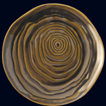
Coupe Plate V945 D 10 1/2" V944 D 8 1/4" V943 D 6 1/4"

With colors developed to meet the specific needs of the US market, Grain capitalizes on the farm-to-table movement by bringing a sense of nature and movement to your presentation. The coupe plates capture the essence of wood grain, rippling water and stone, while the brilliant colors pair well with Pillivuyt's bright white porcelain body. The addition of embossed coupe bowls and mugs creates a complete collection that is sure to make any table come alive.