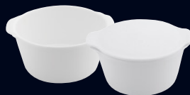
Deep Cocotte 6660V968 D 7 7/8" (2.3 qt) Induction 6660V965 D 6" (30 oz) Induction Lid 6659V970 D 7 7/8" (Fits V968) 6659V967 D 6" (Fits V965)