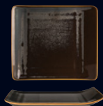
Plate 6661V550 L 6 1/2" W 5 3/4"