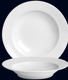
Deep Dish 6631V500 D 12 1/2" Mini Dish 6631V534 D 3 3/4"