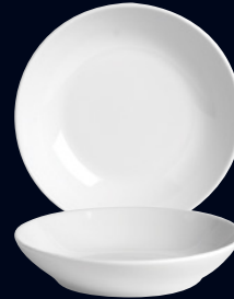
Deep Plate 6634V631 D 10 1/4" 6634V630 D 9"