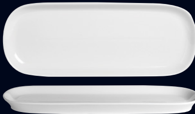
Oblong Platter 6634V660 L 20 3/4" W 8 1/4"