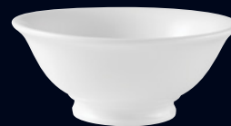
Salad Bowl Ordinaire 6634V611 D 13" (4 1/4 qt) 6634V610 D 10 1/2" (3 qt) 6634V609 D 9 3/4" (2 qt) 6634V608 D 8 3/4" (2 qt) 6634V607 D 7 3/4" (1 qt) 6634V606 D 6 1/2" (24 oz) 6634V605 D 5" (10 oz)