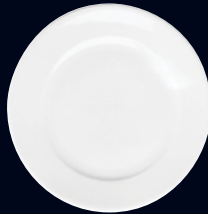
Plate 6626V366 D 12 1/4" 6626V365 D 10 1/2" 6626V358 D 6"