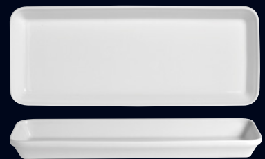
Catering Platter 6634V872 L 19 1/2" W 8"