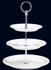
6634V869 Cake Stand 3-Tiered D 9 1/2" H 12 3/4"