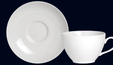
Breakfast Cup 6625V334 L 5" H 2 5/8" (9 oz) Saucer 6625V340 D 6 3/8" (Fits V334)