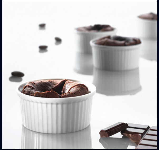
Ramekin Plissé 6634V735 D 3" (4 oz)