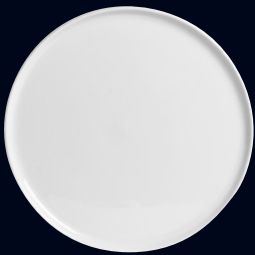
Cake Platter 6634V847 D 13" 6634V846 D 11 3/4"