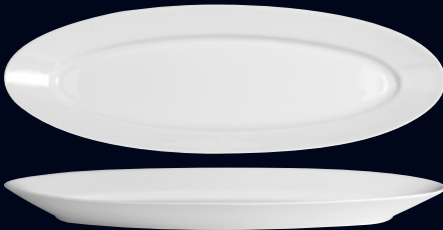
Oval Fish Platter 6634V687 L 23" W 7 3/4" 6634V686 L 17 1/2" W 6 3/4"