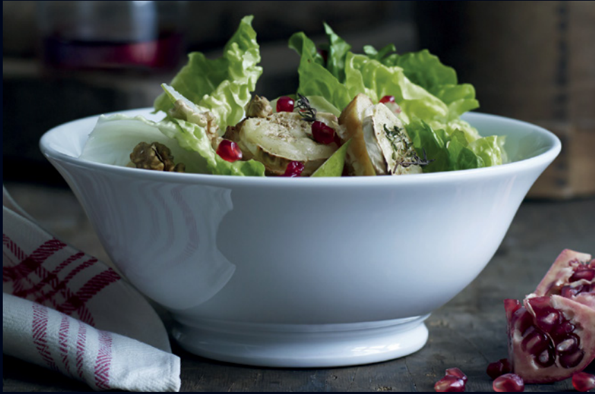
Salad Bowl Ordinaire 6634V611 D 13" (4 1/4 qt)