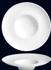
Degustation Plate 6625V348 D 11" (12 1/2 oz) (5 1/2" Well) 6625V347 D 10 1/2" (7 oz) (4 3/4" Well) 6625V346 D 8" (5 oz) (4 1/4" Well) 6625V345 D 5" (1 1/4 oz) (2 3/4" Well)