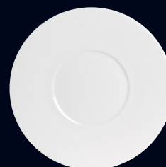
Plate Round Well 6636V883 D 12 1/8" (Well 6")