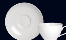
Breakfast Cup 6625V334 L 5" H 2 5/8" (9 oz) Saucer 6625V340 D 6 3/8"