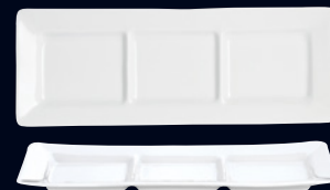
Rectangular Platter 6628V453 L 15 1/4" W 5 3/4" 3 Compartments