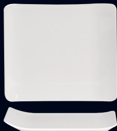
Plate 6632V556 L 11 1/2" W 11" 6632V554 L 10 1/4" W 9 3/4" 6632V550 L 6 1/2" W 5 3/4" 6632V551 L 8 1/4" W 7 3/4"