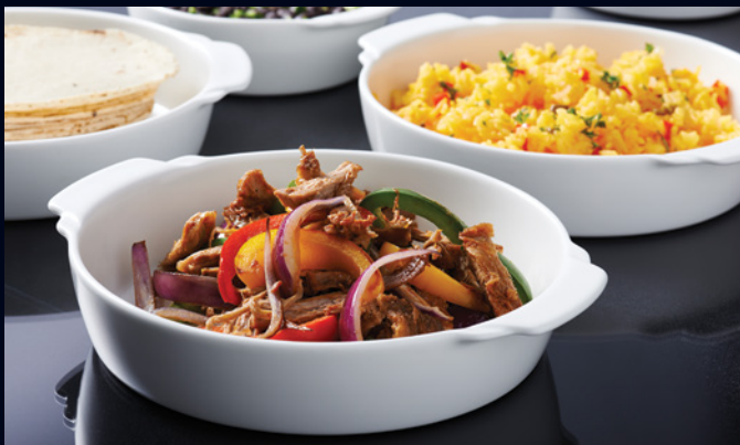
Shallow Cocotte 6660V969 D 7 7/8" (1 qt) Induction