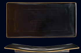
Rectangular Degustation Plate 6661V447 L 12 1/2" W 6 1/4"