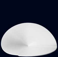
Folded Presentation Plate 6677V180 L 11 7/8" W 7 3/8" H 5 1/4"

An audacious collection, the Canopée range uses the Pillivuyt iconic pleats to provide a unique perspective on foodservice presentation and to offer products with a shape that is both soft and dynamic. The perfect accompaniment to other porcelain patterns, each piece is carefully formed to create a backdrop for your food and add personality to your tabletop.