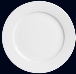
Plate 6631V486 D 12 1/2" 6631V485 D 11" 6631V484 D 10 1/4" 6631V483 D 9 1/2" 6631V481 D 7 3/4" 6631V480 D 6 3/4" 6631V479 D 6"

Boasting a flat rim profile associated with the classic “bistrot” shape, Sancerre by Pillivuyt provides chefs with the perfect canvas for inspired food service presentation.