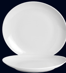
Oval Steak Plate 6634V633 L 11 1/2" W 10" 6634V632 L 9" W 8"