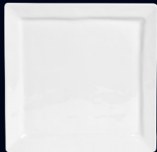
Square Plate 6628V439 L W 11 1/2" 6628V438* L W 9 3/4" 6628V436* L W 7" 6628V435 L W 4 1/4"

A surprisingly “old” yet contemporary design taken from an 1800’s mold, Quartet was stylishly modeled after a popular dish towel design of that time. Boasting the rustic look of hand-thrown china, Quartet still offers the stacking capabilities required of modern restaurants.