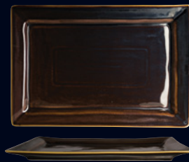
Rectangular Plate 6661V456 L 13 1/2" W 9"