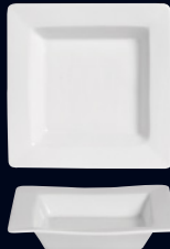
Deep Plate 6628V431* L W 7 3/4"