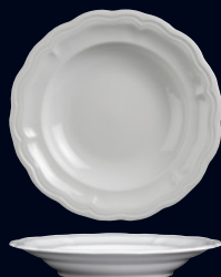
Deep Plate 6640V920 D 9 1/2"