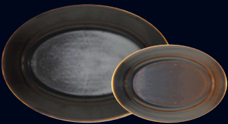
Oval Platter 6661V373 L 13" W 9 1/4" 6661V371 L 11" W 7 1/2" 6661V369 L 8 3/4" W 6"

With a bronzed, two-tone glaze, Sento captures familiar and classic shapes and transforms them into one-of-a-kind show pieces that are sure to add excitement to any table. The reactive glaze that blends brilliant and matte finishes ensures each piece has its own exclusive character. Used alone or paired with complementary whiteware, these contemporary pieces will help ensure that each dining experience is unique and memorable.